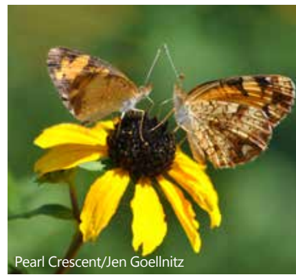
Pearl Crescent/Jen Goellnitz