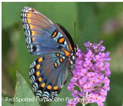
Red Spotted Purple/John Flannery