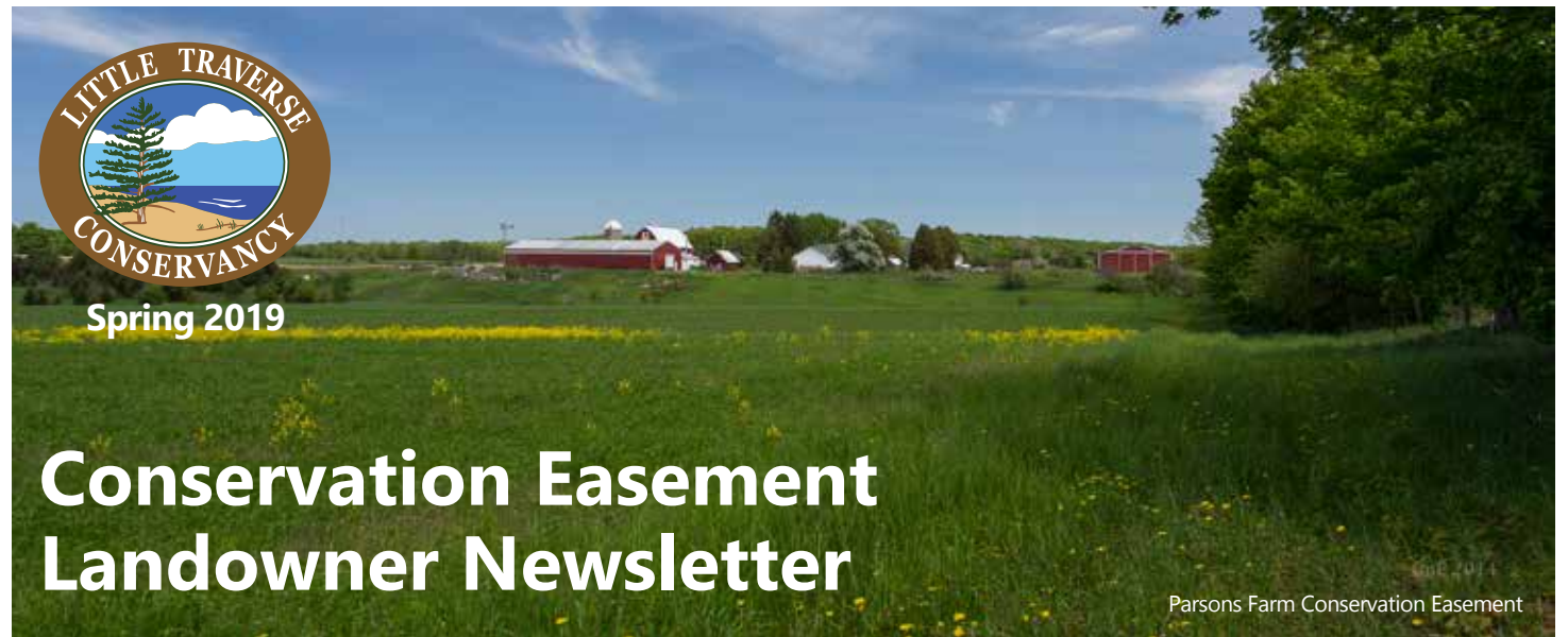
Parsons Farm Conservation Easement