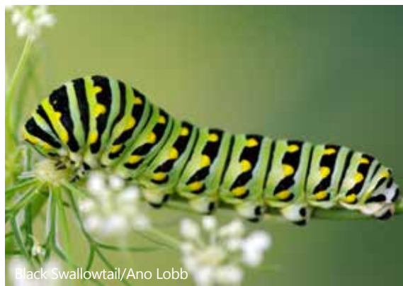
Black Swallowtail/Ano Lobb