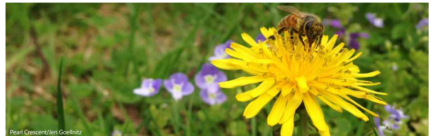
Pearl Crescent/Jen Goellnitz