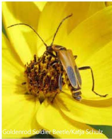
Goldenrod Soldier Beetle/Katja Schulz