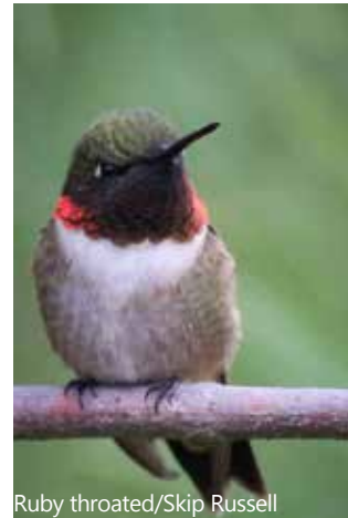
Ruby throated/Skip Russell