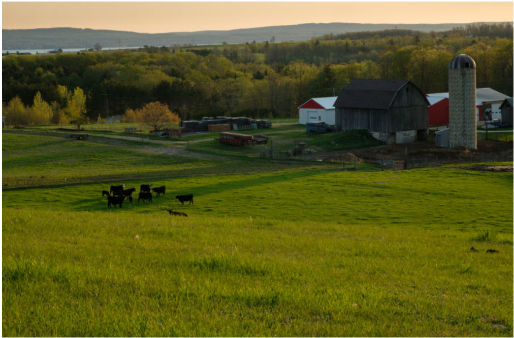
Crothers Farm Conservation Easement/Todd Parker