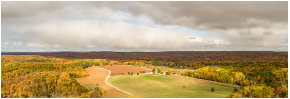
Angell Farm Conservation Easement