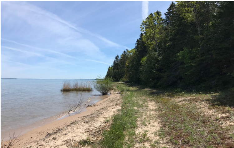
Gaines Family Conservation Easement

In some cases, the conservation easement may reduce the value of the property to a level less than the current assessment.