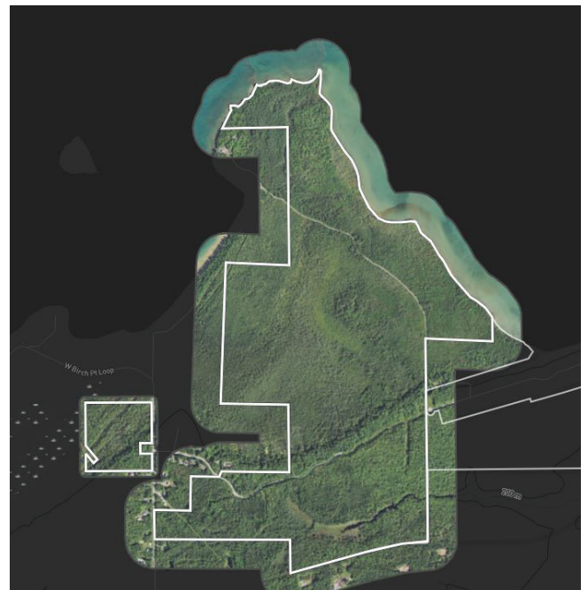
Remote satellite imaging is a cost effective way to monitor both nature preserves and conservation easements. Above is an image used to monitor the Round Island Point Nature Preserve near Brimley.

If you or your representative would like to accompany staff during the visit or to make other special arrangements, simply call or email Melissa: 231.344.1004 or melissa@landtrust.org .